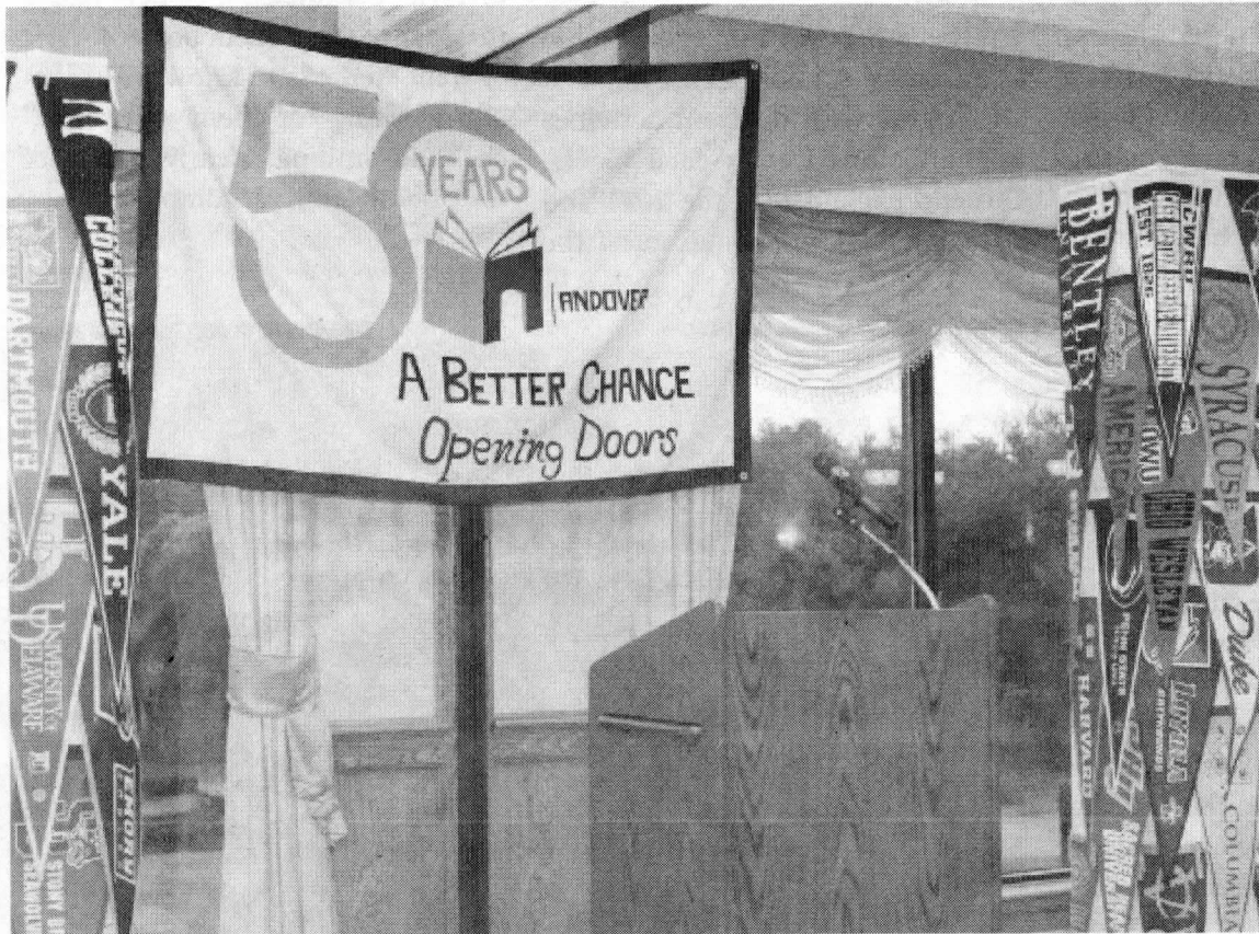
Above: A banner for the event is bookended on either side by flags of alumnae's colleges. At right: The door of the ABC House is marked with the names of returning alumnae.